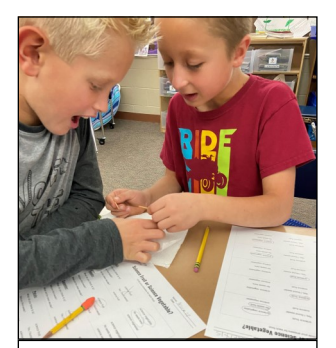
Emmet & Bruce discovering seeds...so...can a tomato be a fruit? It depends on who you ask!